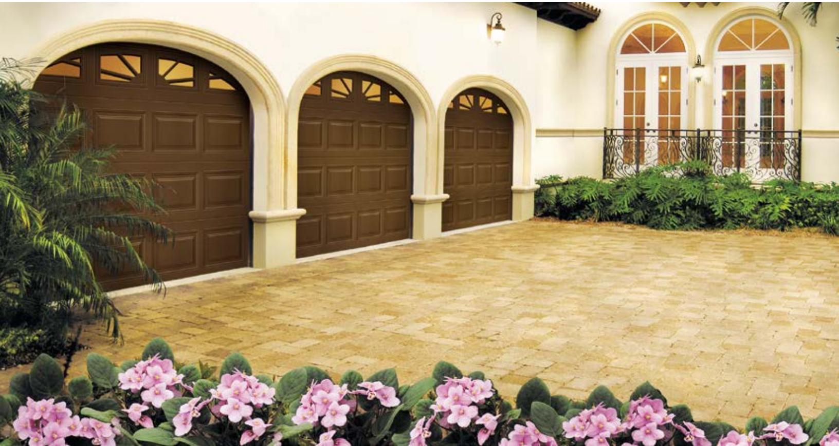
Model 4300 Short Elegant Panel with Optional Impact Resistant Windows and Sunset 503 Decorative Inserts