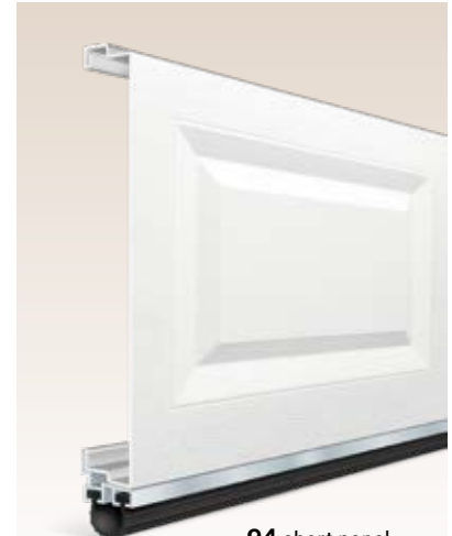
94 short panel