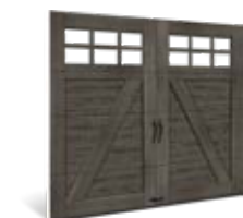
CANYON RIDGE® CARRIAGE HOUSE, ELEMENTS, CHEVRON, LOUVER, MODERN

QuietFlex™ hinge is not available on all door heights.