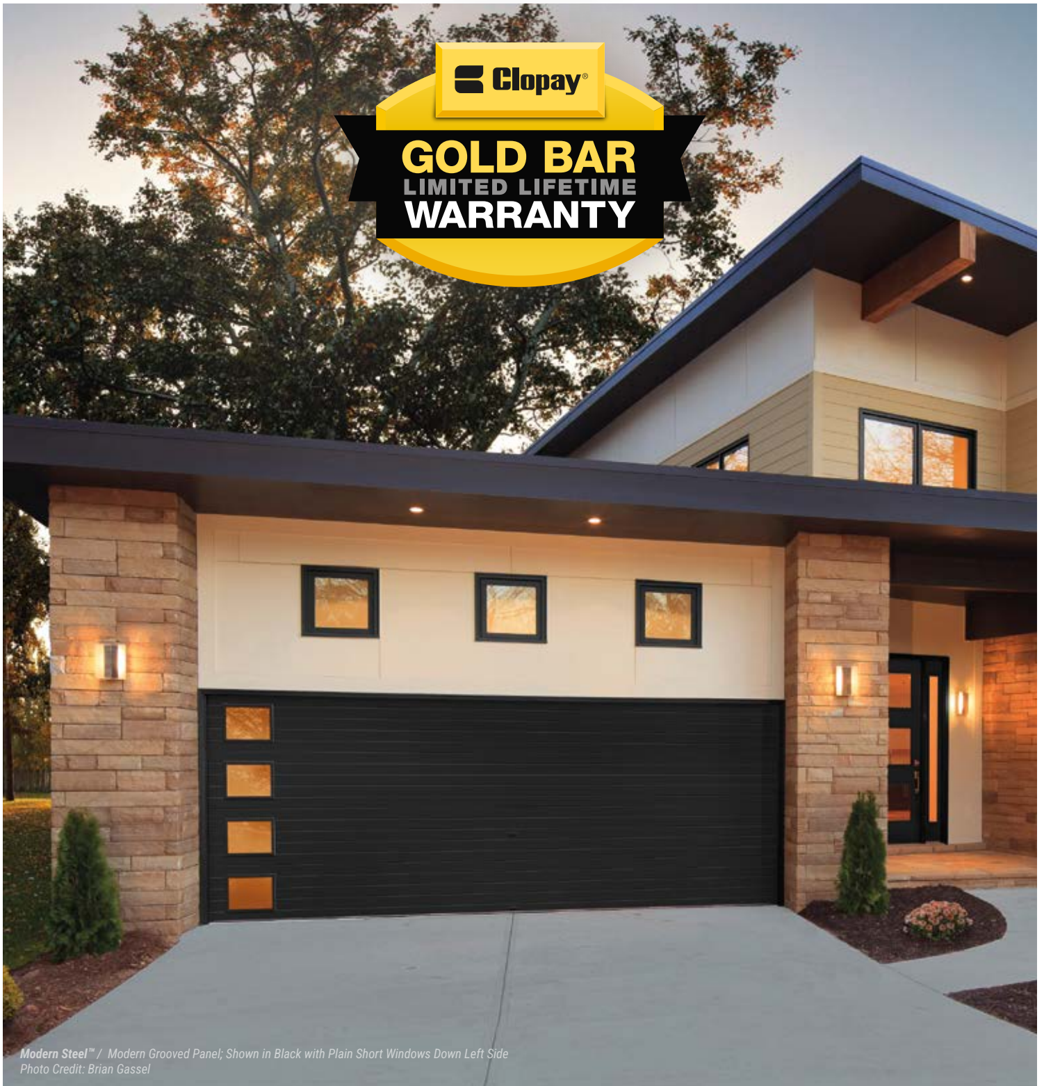
Modern Steel™ / Modern Grooved Panel; Shown in Black with Plain Short Windows Down Left Side

A golden opportunity to invest in the beauty and value of your home.