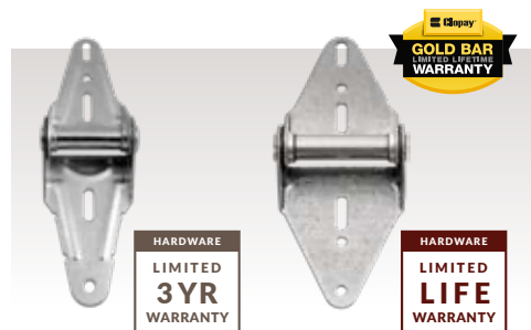
STANDARD 18 GAUGE HINGES

For doors using extension springs; extension spring warranted for 3 years.