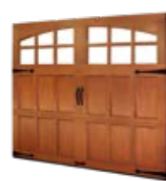
RESERVE® WOOD SEMI-CUSTOM LIMITED EDITION CUSTOM MODERN