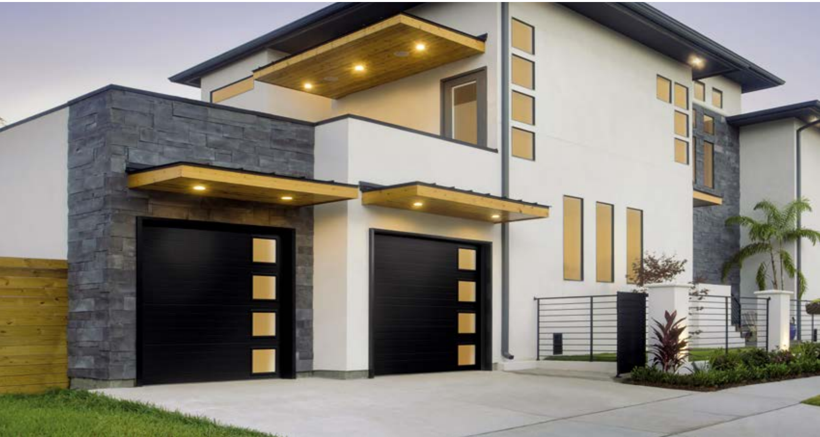
Modern Steel™ / Modern Grooved Panel; Shown in Black with Impact Resistant Plain Short Windows